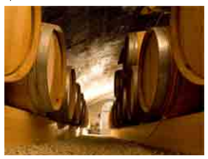
DAY 5- Cadillac (Sauternes)

Today's tour takes you to Saint-Émilion, a UNESCO World Heritage Site, where you see the town's superb medieval streets and buildings and its wine caves, carved out of the plateau on which the town was built centuries ago. Taste some local vintages, both from the Saint-Émilion and the Pomerol appellations at a nearby chateau. Spend a pleasant afternoon exploring the town's streets and shops—or take an optional excursion to the Bergerac area in the Dordogne, to learn more about truffles, a great French delicacy. We remain docked in Libourne until early morning, so you can take a stroll after dinner to see the Gothic church, clock tower and the Town Hall on the main square. (B, L, D)