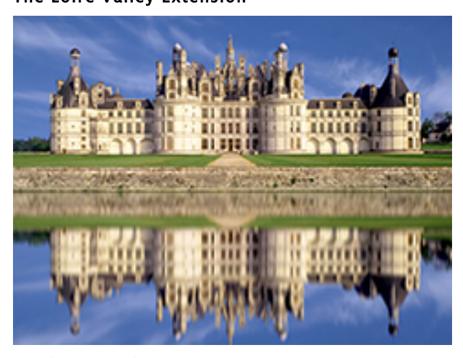
3 nights—From $899 per person

Discover France's amazing and beautifully scenic Loire Valley. After one night in Paris,