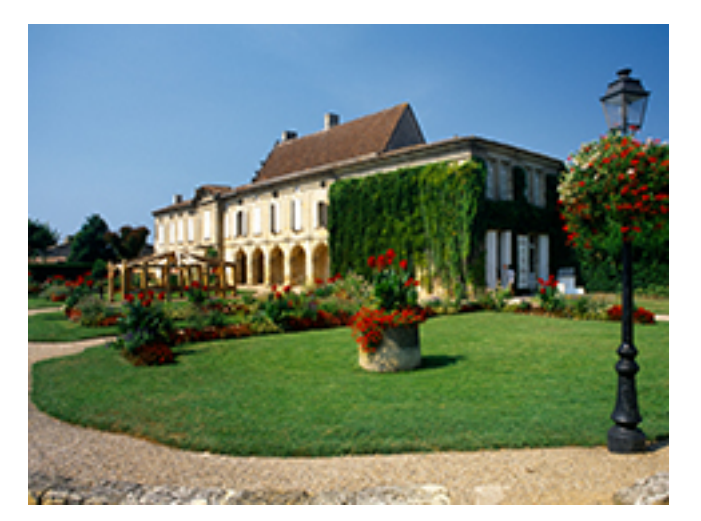
DAY 6 - Cadillac & Bordeaux

Take a walking tour of the working town of Cadillac this morning to see the ancient harbor, the fishing boats and the townspeople plying their trades. You will also see the elegant 16th-century château, complete with grand courtyard and moat, and the city walls with their iconic Clock Gate and Sea Gate. Return aboard for lunch as we begin sailing along the Garonne toward Bordeaux, where we arrive in the late afternoon. Dine aboard or go ashore—we remain docked overnight so you are free to explore the city's restaurants, bars and nightlife. (B, L, D)