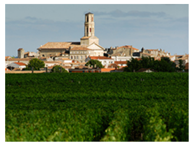
DAY 2- Pauillac (Margaux)

Sail along the Gironde River this morning, docking at Pauillac in the Médoc region before lunch. This afternoon, take a wine country tour featuring several wine-tasting opportunities, including the area's famous full-flavored Margaux. Relax on board this evening, or explore Pauillac's marina and the Plaza Lafayette—Pauillac is where the Marquis de Lafayette set sail to the New World. Undisputed capital of the Médoc wine region, Pauillac is home to Châteaux Lafite Rothschild, Latour and Mouton Rothschild, among others. You may also catch a glimpse of the lighthouse on the Île de Patiras in the middle of the Gironde. (B, L, D)