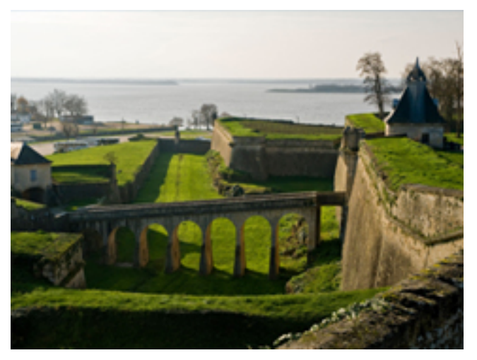
DAY 4- Libourne (Saint-Émilion)

Today's tour takes you to Saint-Émilion, a UNESCO World Heritage Site, where you see the town's superb medieval streets and buildings and its wine caves, carved out of the plateau on which the town was built centuries ago. Taste some local vintages, both from the Saint-Émilion and the Pomerol appellations at a nearby chateau. Spend a pleasant afternoon exploring the town's streets and shops—or take an optional excursion to the Bergerac area in the Dordogne, to learn more about truffles, a great French delicacy. We remain docked in Libourne until early morning, so you can take a stroll after dinner to see the Gothic church, clock tower and the Town Hall on the main square. (B, L, D)